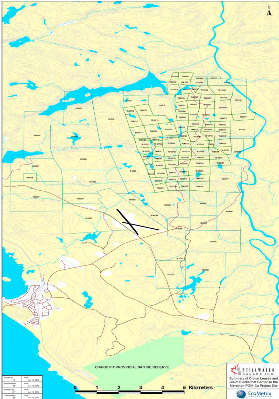
Figure B. Summary of Crown Leases and Claim Blocks that Comprise the Project site