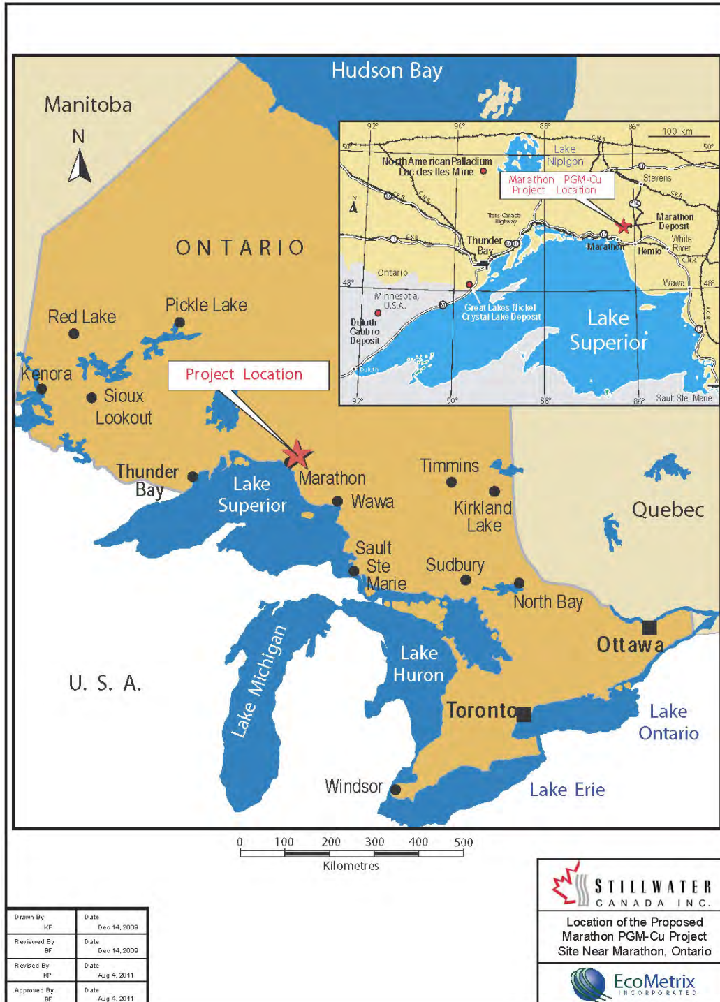
Figure A. Location of the Proposed Marathon PGM-Cu Project Site near Marathon, Ontario