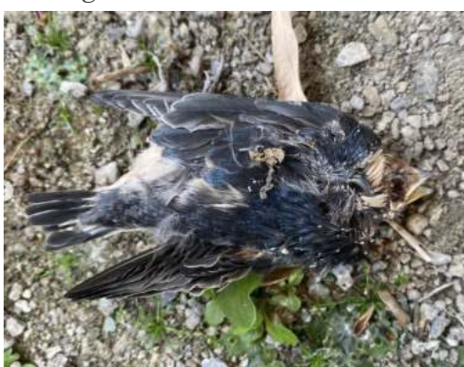
15 July 2023