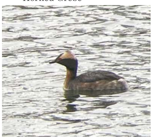
18 April 2023