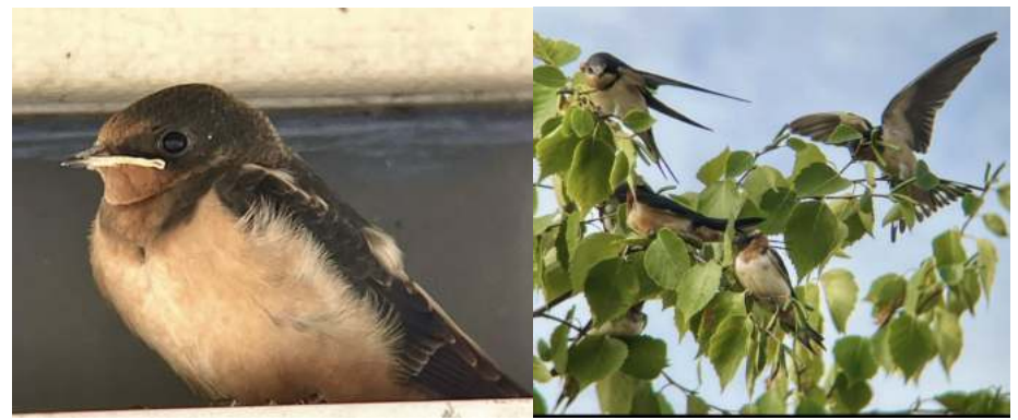
1 Aug 2022