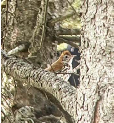
9 May 2022