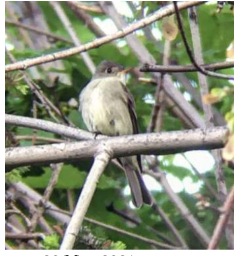
20 May 2021