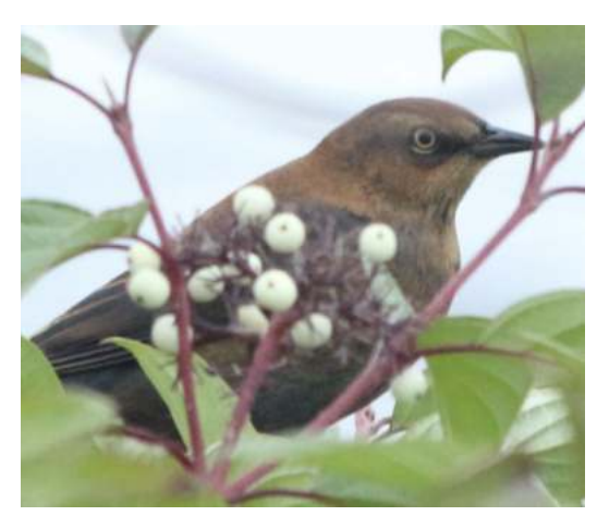
24 September 2022