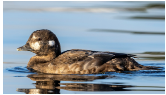
6 Nov 2021