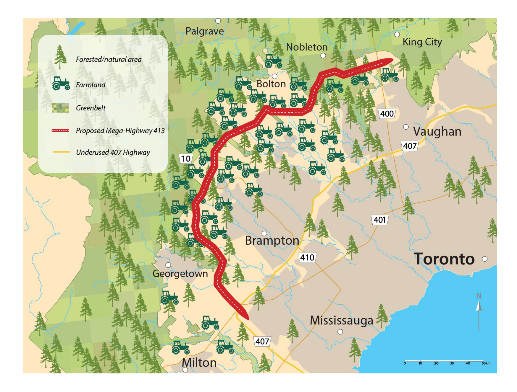
An illustration from Frankrantel Defense about hour close the planned OTA Meet

The negative impact of such development and the loss of Greenbelt lands could be avoided with simple alternatives.