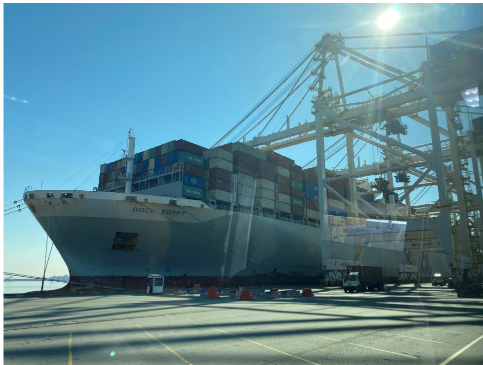
Figure 6. View of gantry cranes from below while operating on container ships