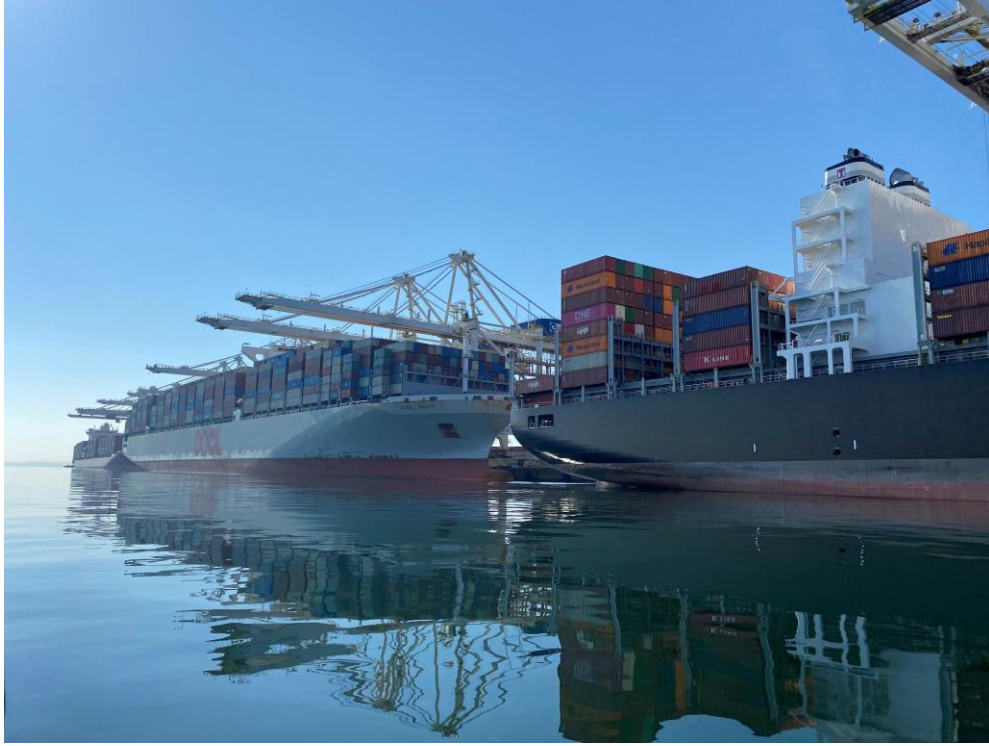
Figure 7. View from the water of container ships docked at Deltaport