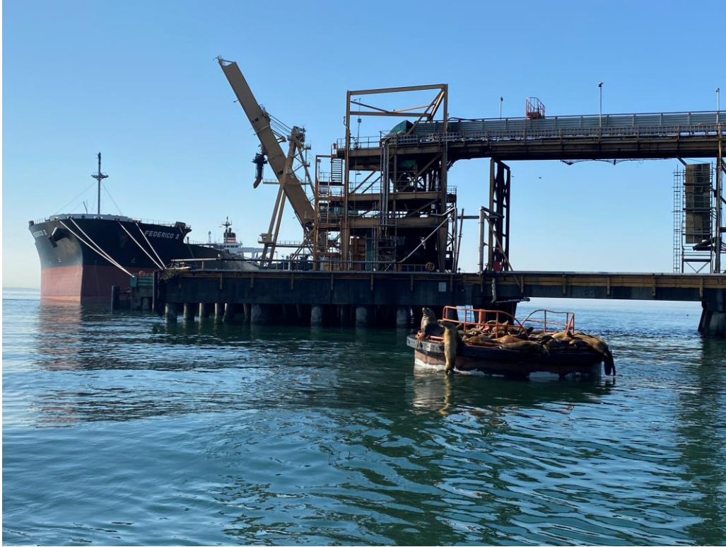
Figure 8. Steller sea lions on buoy with Westshore Terminals in the background