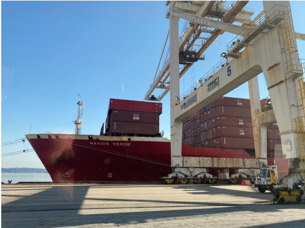
Figure 5. View of gantry cranes from below while operating on container ships