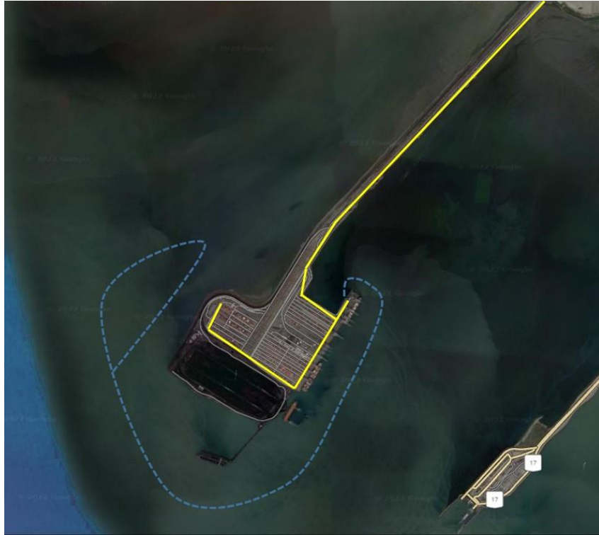
Figure 2. Map of site tour. Yellow line represents the shuttle bus route. Blue dotted line represents the approximate marine tour route.