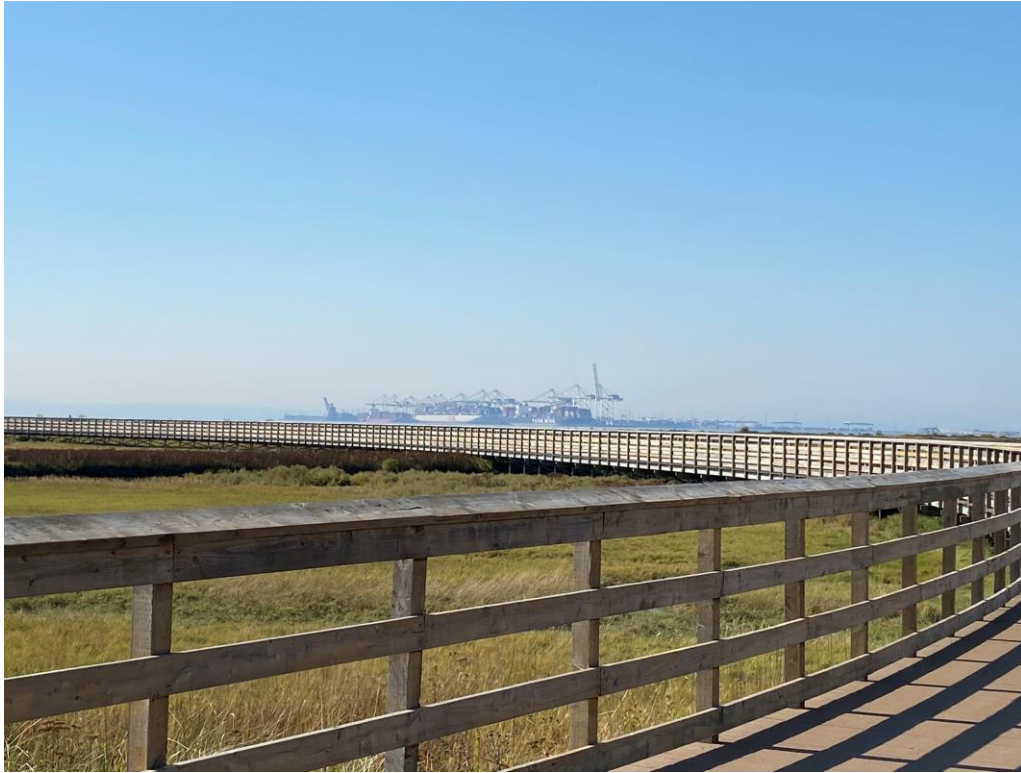
Figure 3. View of Deltaport terminal and Westshore Terminal from the Tsawwassen First Nation boardwalk