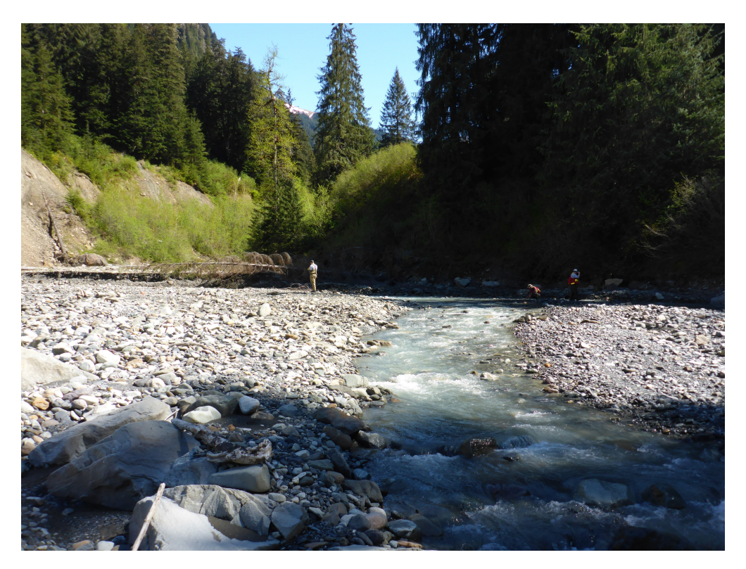
Photo 5: Bitter Creek Road Interference Area (station 4+550 m to 4+840 m), showing side channel on river right (looking upstream) May 16, 2017