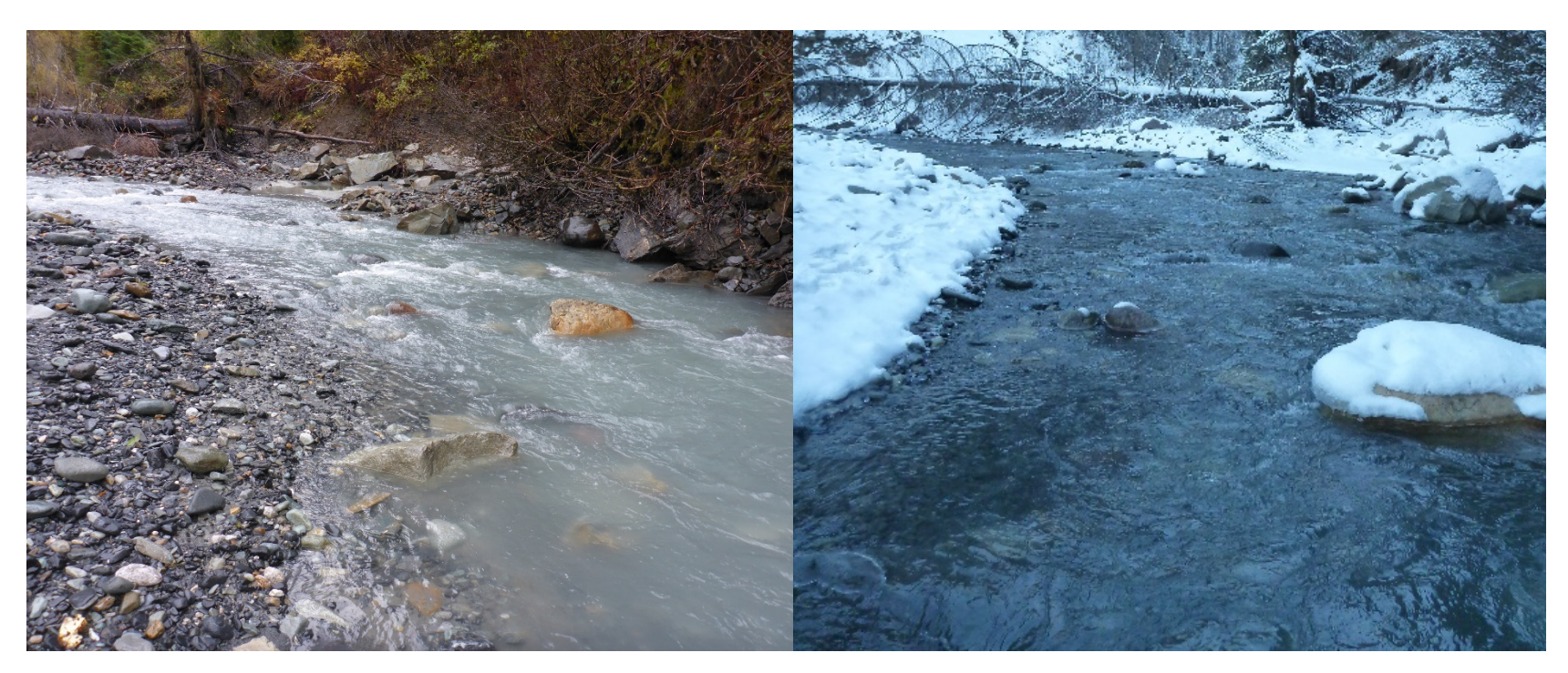
Photo 6: Bitter Creek Road Interference Area (station 4+550 m to Photo 7: Bitter Creek Road Interference Area (station 4+550 m to 4+840 m), looking upstream at side channel, October 18, 2017