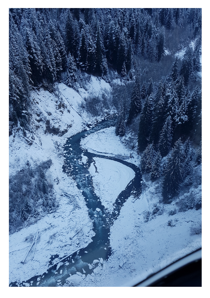
Photo 3: Bitter Creek Road Interference Area (station 4+550 m to 4+840 m), November 8, 2017