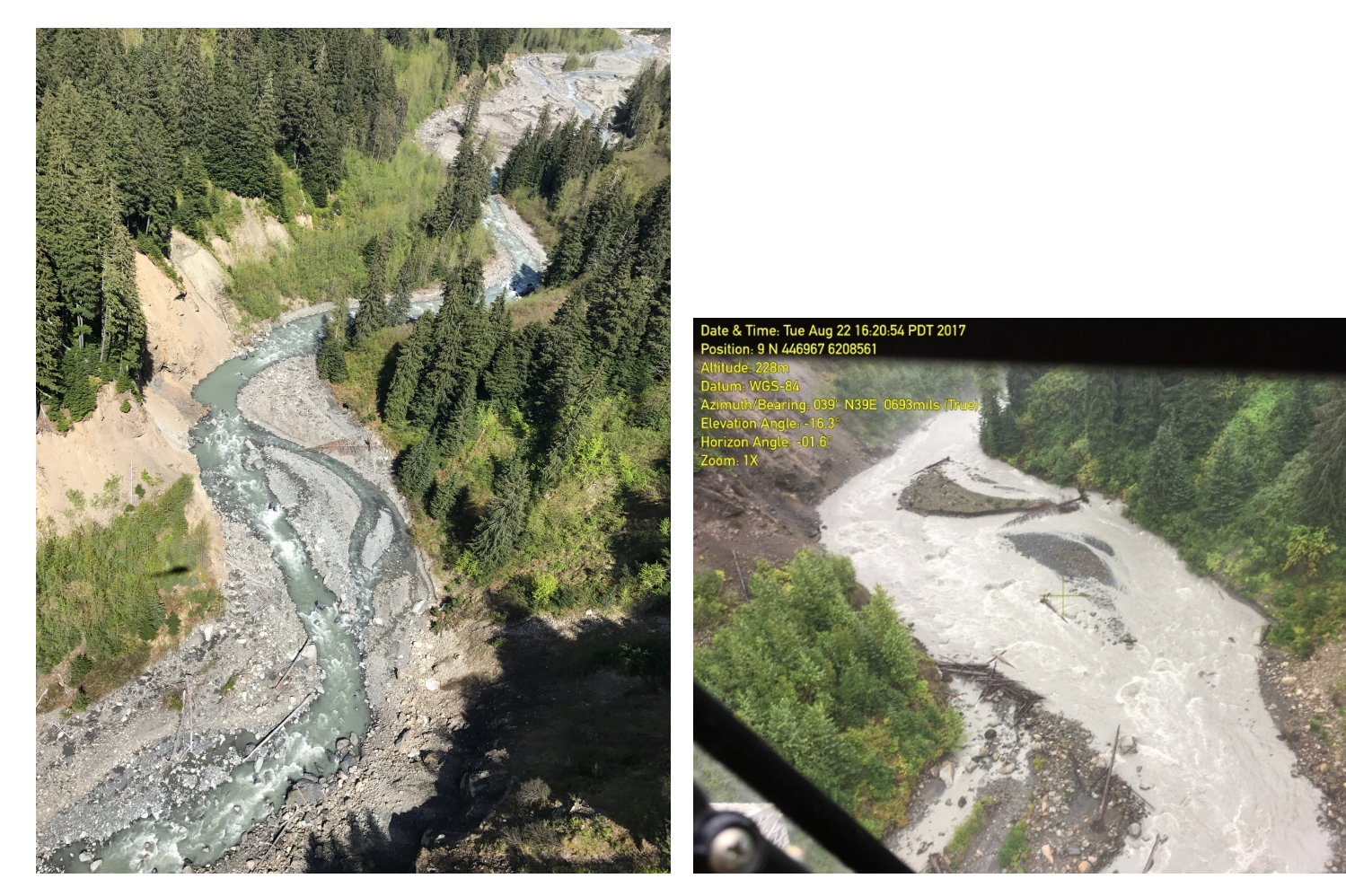
Photo 1: Bitter Creek Road Interference Area (station 4+550 m to 4+840 m), May 16, 2017