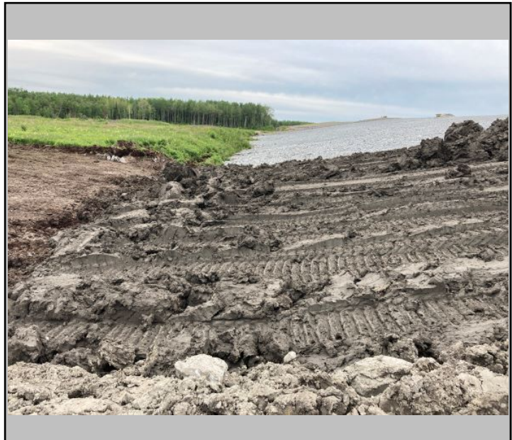
8 Photo #: