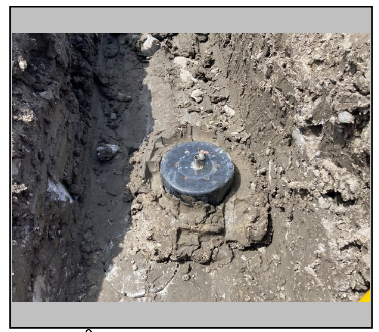
Repair following oversize rock removal from P32, L1