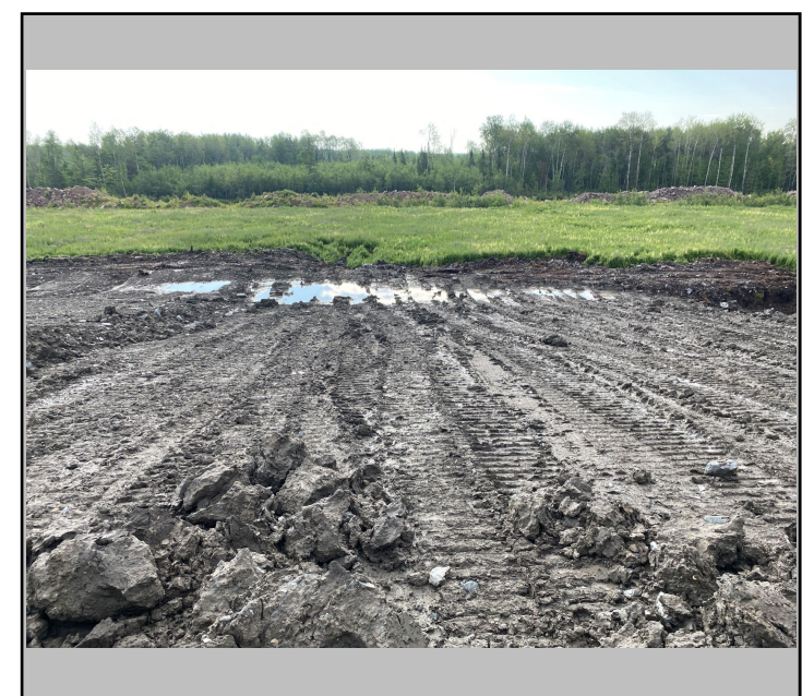
2 Photo #: