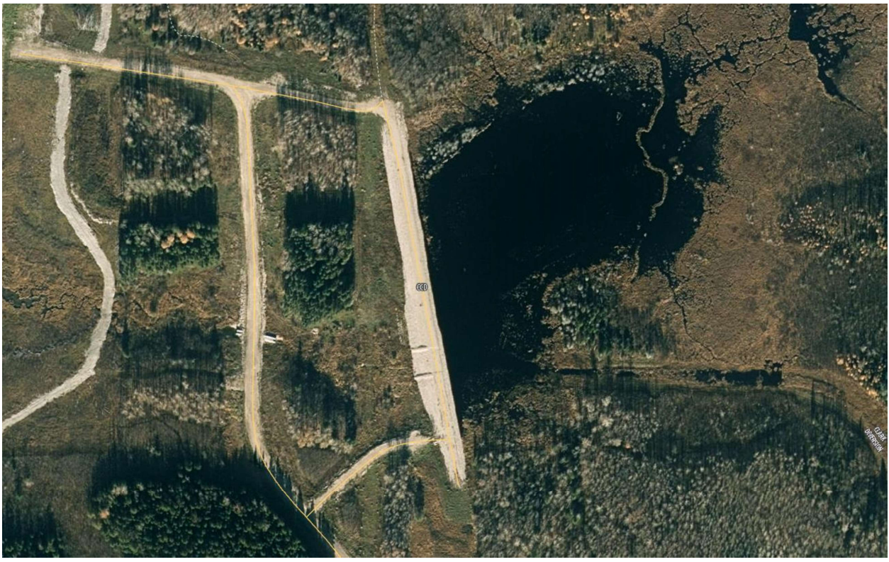
Fig 1. Plan View of Clark Dam