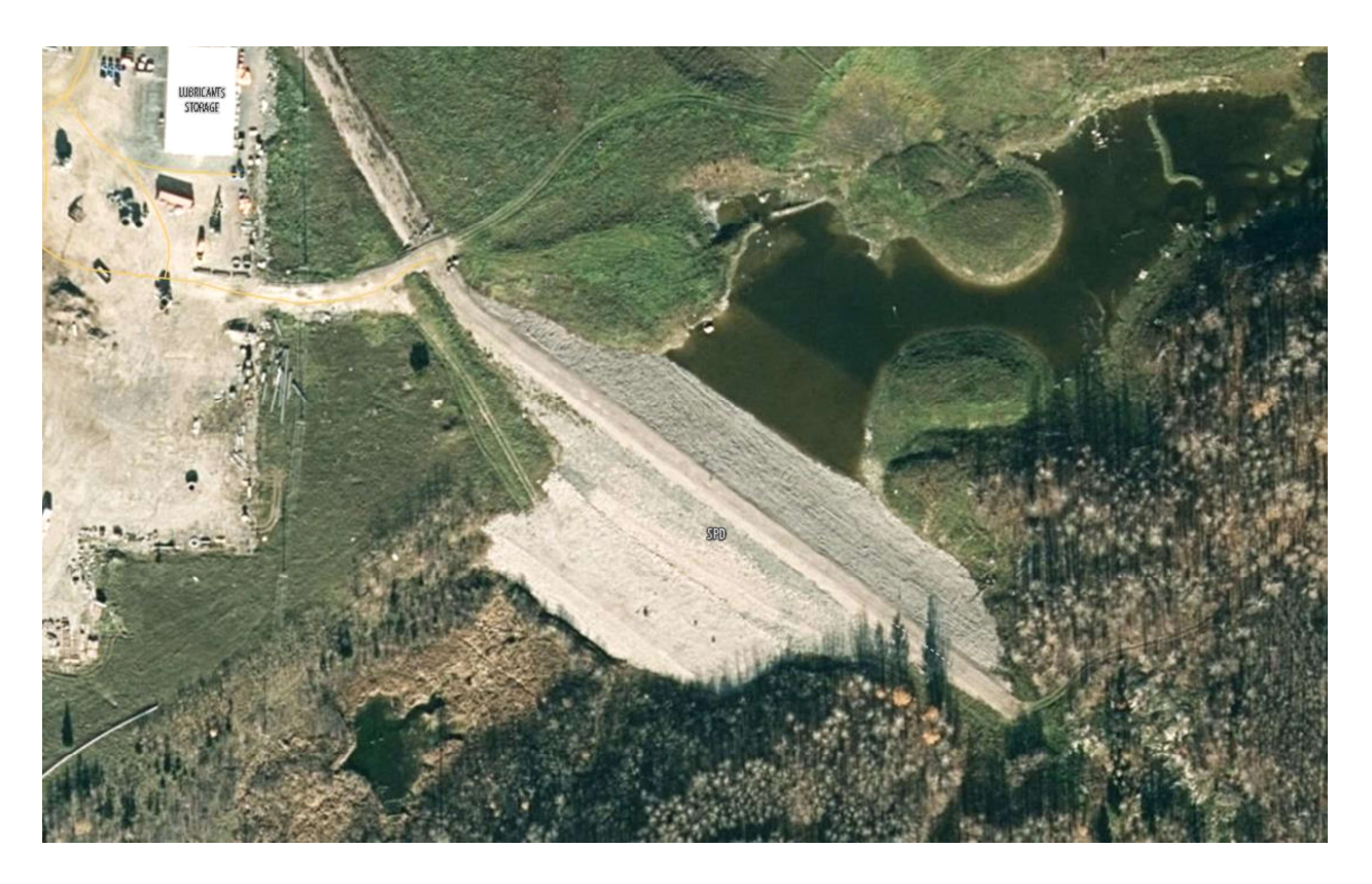
Fig 1. Plan View of SPD Dam