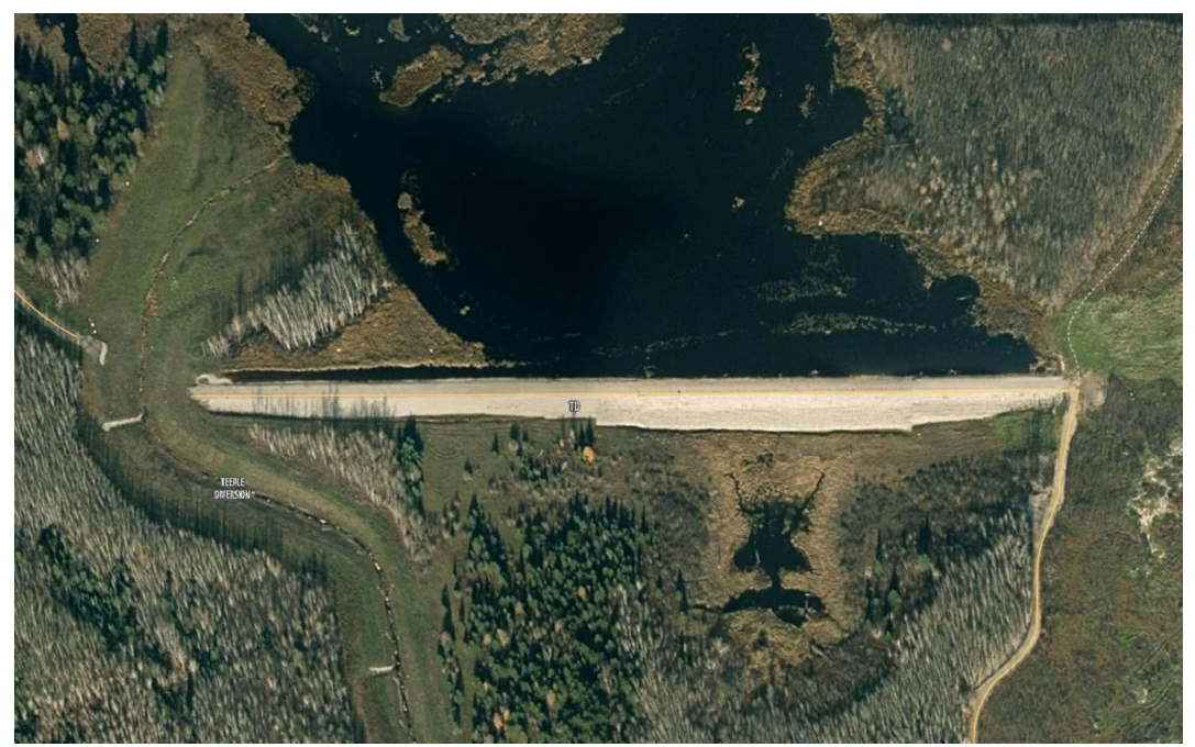
Fig 1. Plan View of Teeple Dam