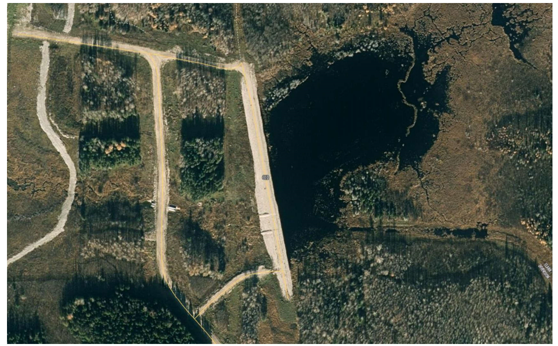
Fig 1. Plan View of Clark Dam