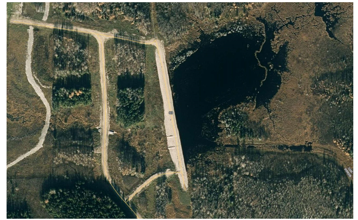
Fig 1. Plan View of Clark Dam