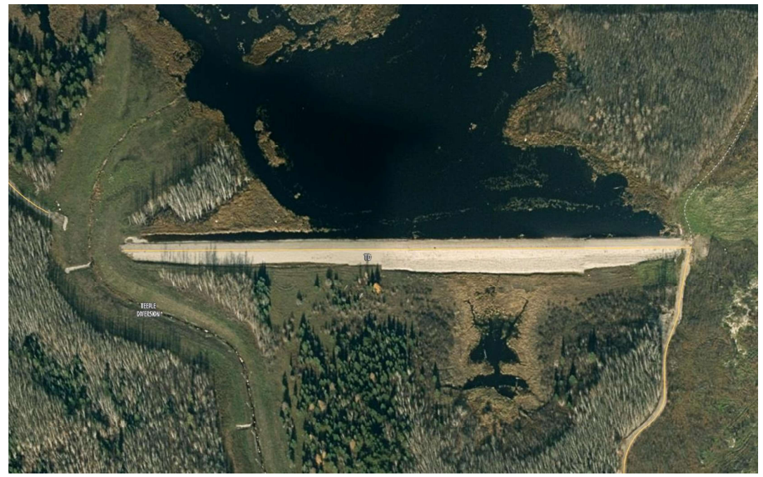
Fig 1. Plan View of Teeple Dam