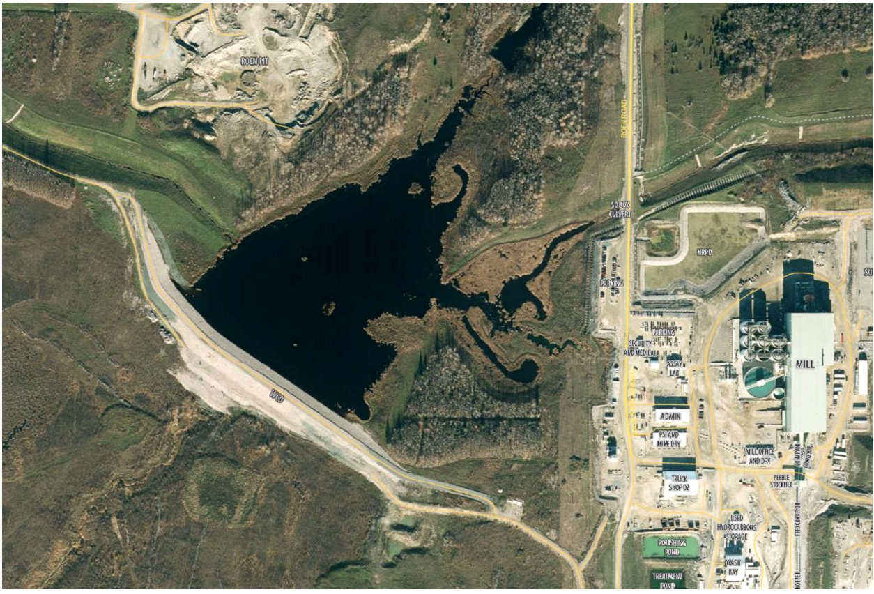
Fig 1. Plan View of WCD Dam