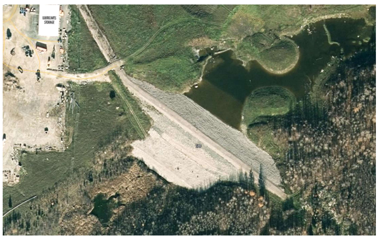
Fig 1. Plan View of SPD Dam