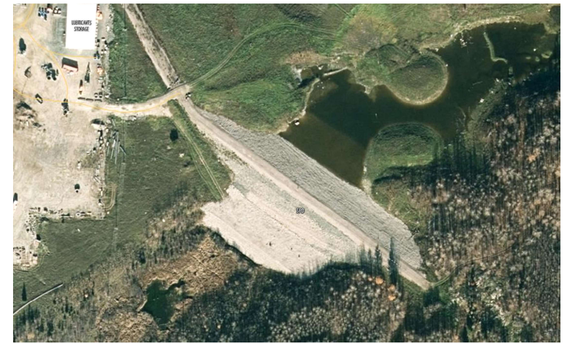
Fig 1. Plan View of SPD Dam