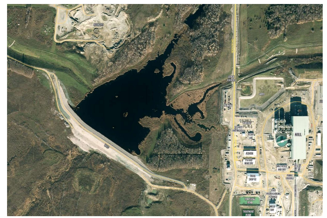
Fig 1. Plan View of WCD Dam