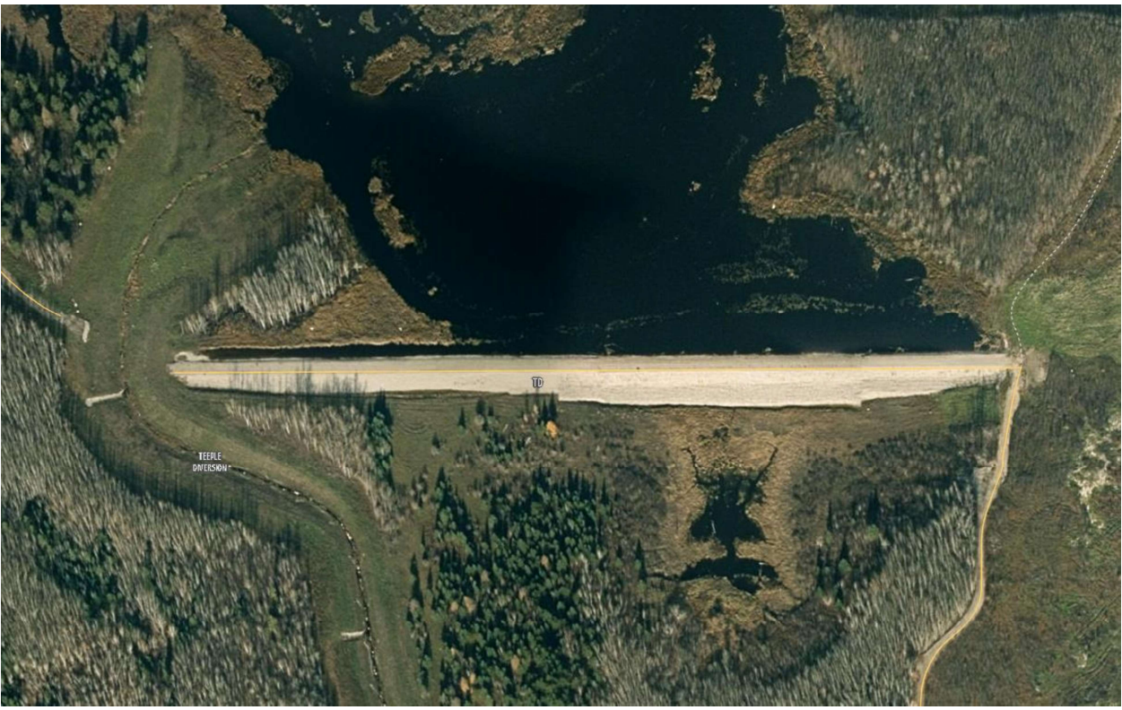
Fig 1. Plan View of Teeple Dam