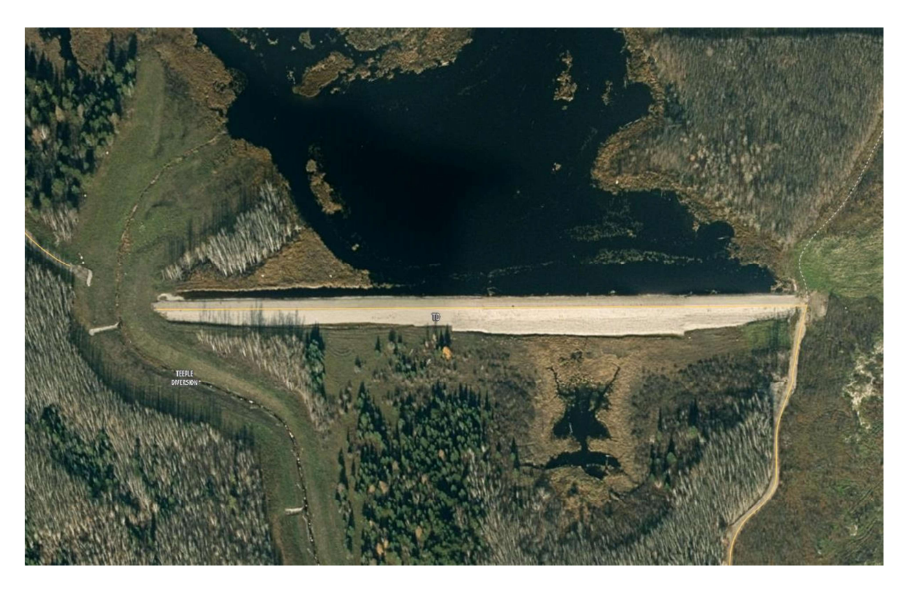
Fig 1. Plan View of Teeple Dam