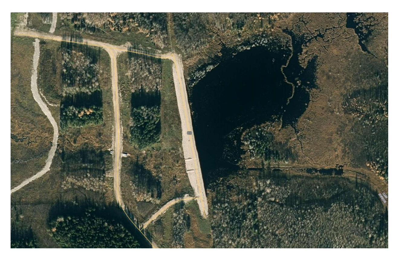
Fig 1. Plan View of Clark Dam