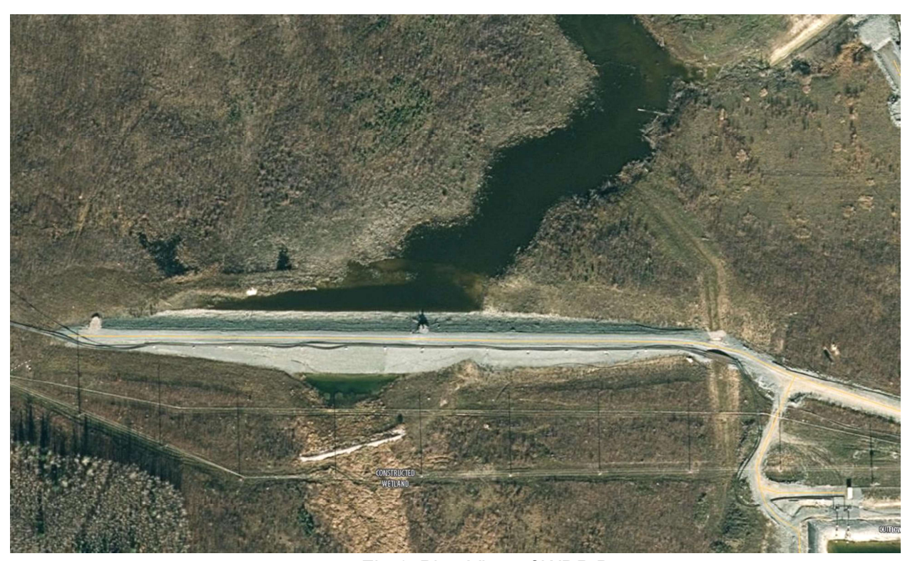
Fig 1. Plan View of WDP Dam