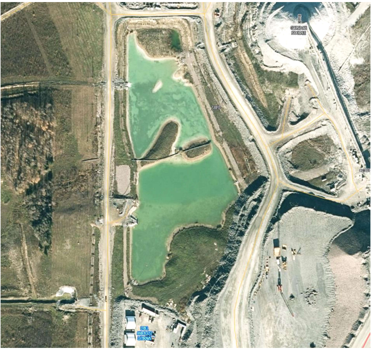
Fig 1. Plan View of SRP Dams