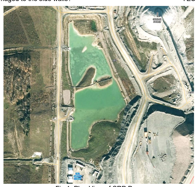
Fig 1. Plan View of SRP Dam