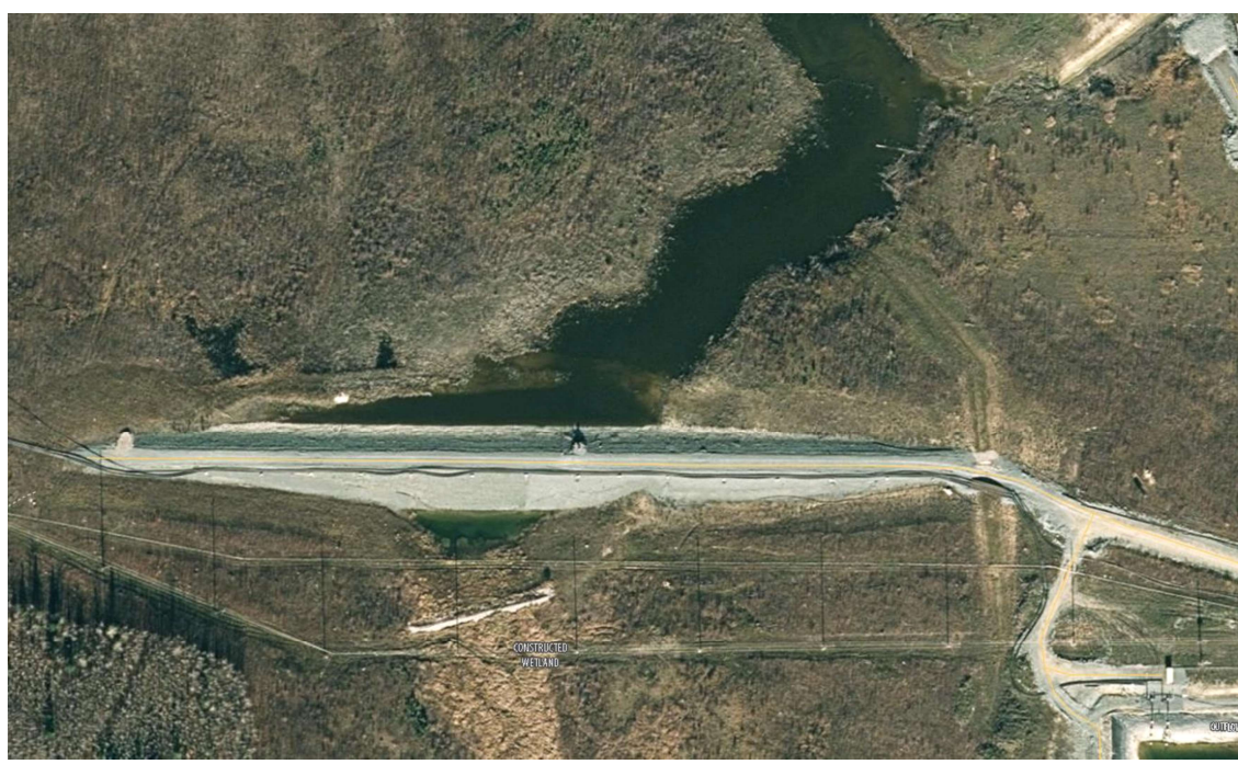
Fig 1. Plan View of WDP

a. If yes use seepage checklist to record the details of the observations