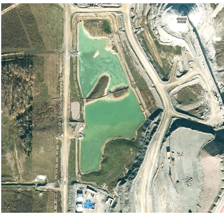
Fig 1. Plan View of SRP

a. If yes use seepage checklist to record the details of the observations