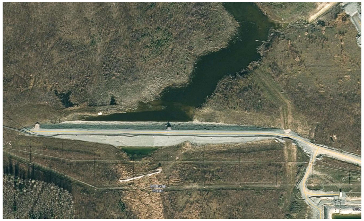
Fig 1. Plan View of WDP Dams