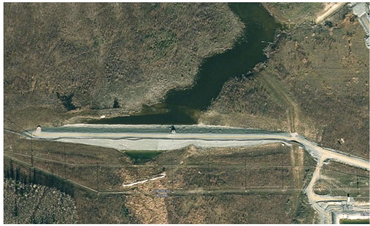
Fig 1. Plan View of WDP Dam