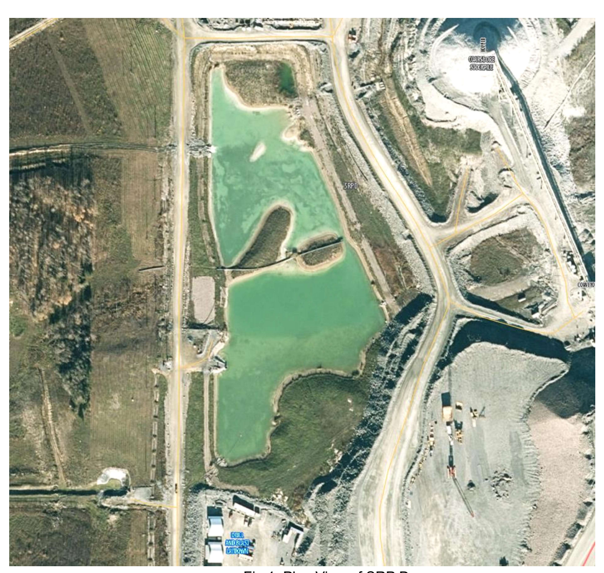
Fig 1. Plan View of SRP Dam