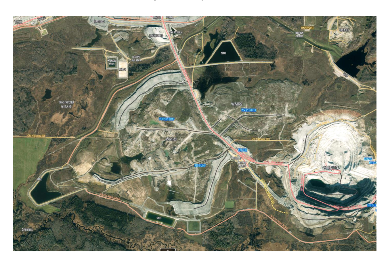
Fig 1. Plan View of Sediment Pond Dams