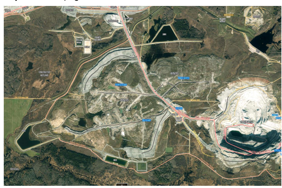
Fig 1. Plan View of Sediment Ponds

a. If yes use seepage checklist to record the details of the observations