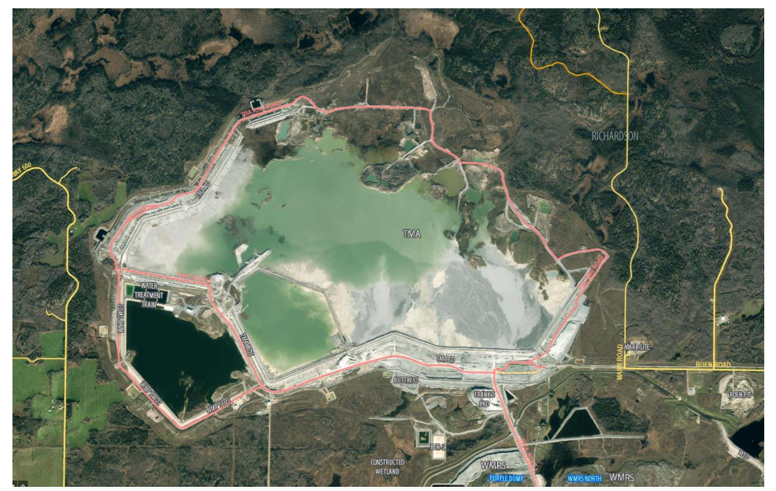
Fig 1. Plan View of TMA