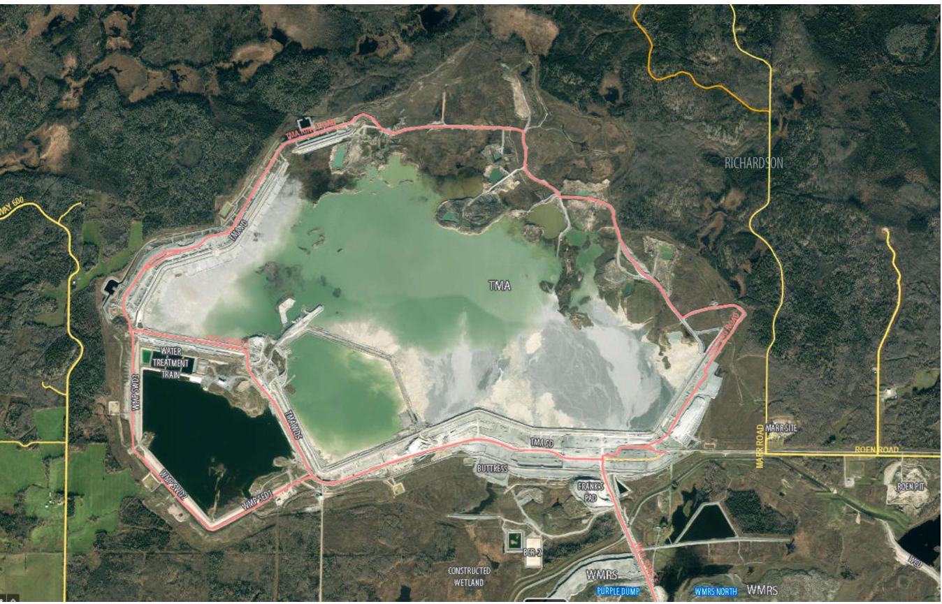
Fig 1. Plan View of TMA