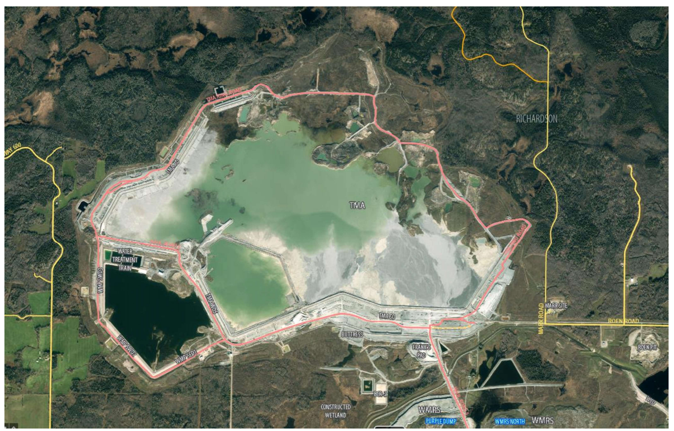
Fig. 1. Plan View of TMA