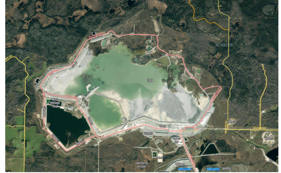
Fig 1. Plan View of TMA